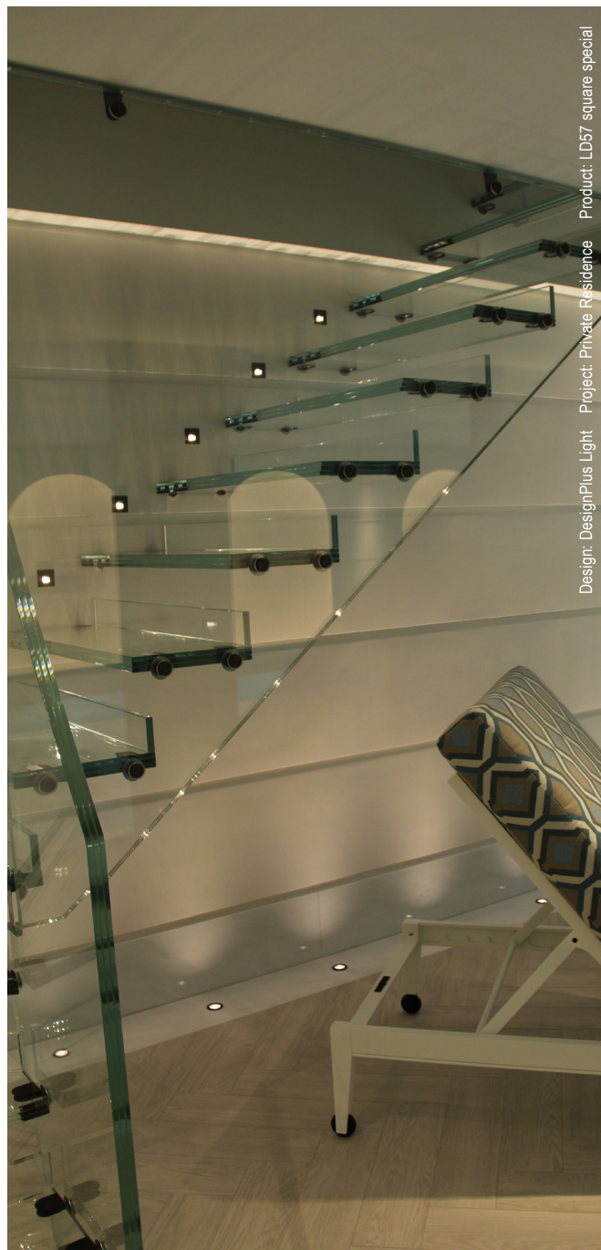
Design: DesignPlus Light Project: Private Residence Product: LD57 square special